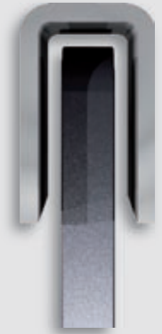
SIDE VIEW OF SENSOR/ACTIVATOR CONFIGURATION