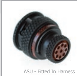
ASU - Fitted In Harness