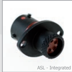
ASL - Integrated