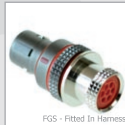
FGS - Fitted In Harness

*We can supply sensors fitted with most connector requirements. Please contact us if you would like to discuss the available options