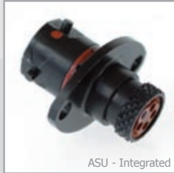
ASU - Integrated