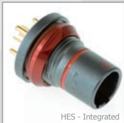
HES - Integrated