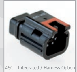
ASC - Integrated / Harness Option